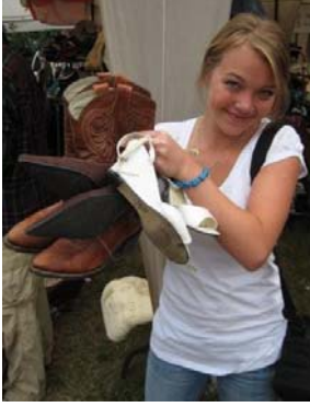
“Shoes and boots... ...come in pairs!”