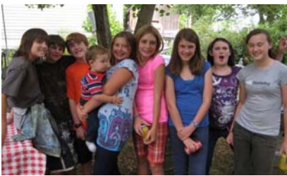
Kids Crew Helping Out

In March, the TLCF treated the community to a baked potato dinner as a thank-you for all the help we have received. We had a large turnout, and a good time was had by all.