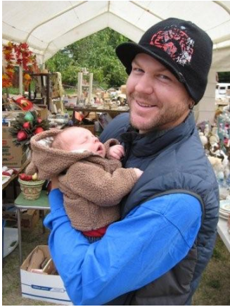
Now that's a treasure!!