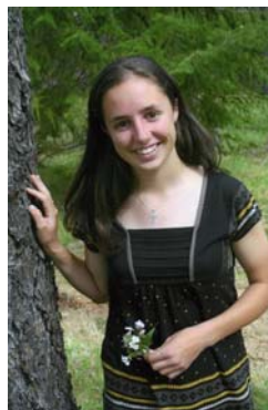
Anna Schmid $500 Community Club, $1,000 Sweighoffer, $500 TLFCF