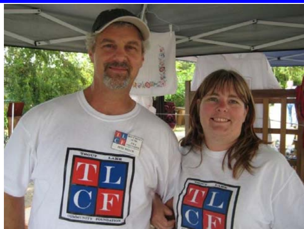
Volunteers—The Fuel of the Foundation's engine